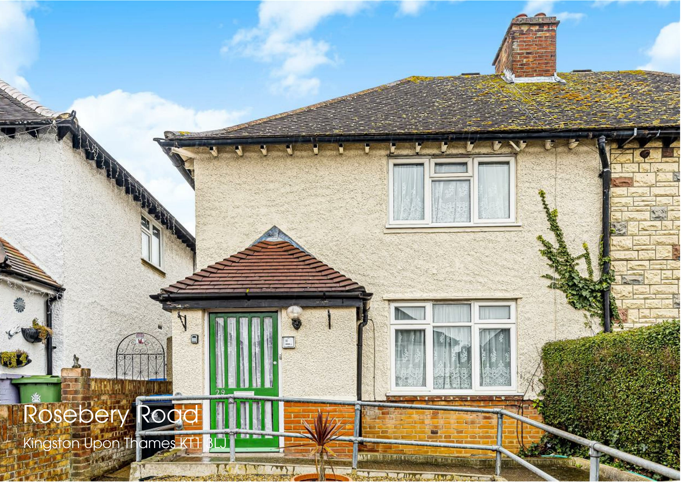
Rosebery Road Kingston Upon Thames KT1 3LJ